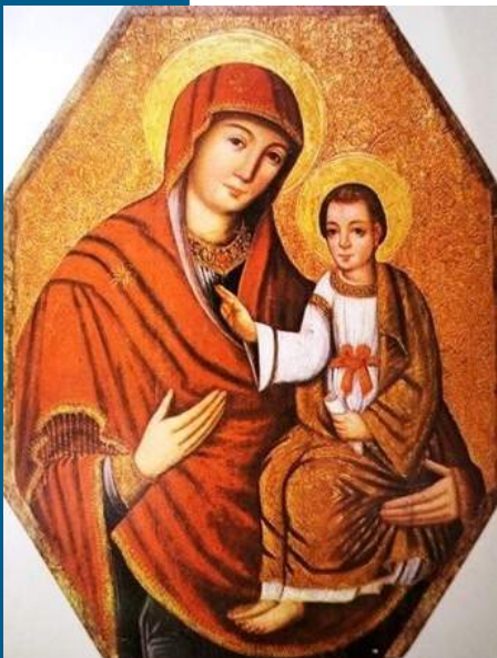
The ancient Ukrainian icon "Doors of Mercy," from the Polish city of Jaroslaw.

M ary, most holy, O ra pro nobis! [Pray for Us!] T heotokos, [Mother of God] H ear our Prayer, E ver-Virgin, R egina Caeli [Queen of Heaven]