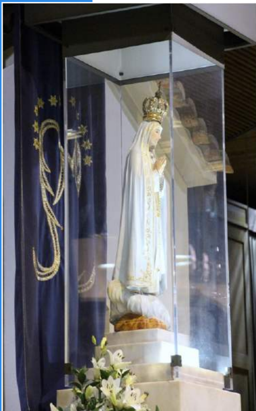
Statue of Our Lady of Fatima located on the site of the Apparitions of 1917