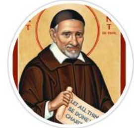
Top Row: St. Padre Pio, St. Faustina, Bottom Row: St. Catherine of Siena, St. Vincent de Paul