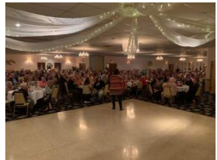
There's more photos from the Pilgrimage Shrine "FUN"draiser on the Photos page of our website.

Our Padre Pio Feast Day Mass was very well attended. There was a testimony read of St. Padre Pio's last hours on earth. It was very moving.