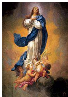
The Feast of the Immaculate Conception of the Blessed Virgin Mary

on December 8 is one of the most prominent Marian feasts in the Catholic Church.